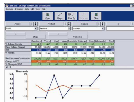
Powerful scenario analysis